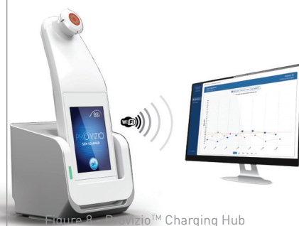
Figure 8 - Provizio™ Charging Hub

To upload readings taken, place the Provizio™ SEM Scanner into the Charging Hub (Figure 8), the device initiates wireless communications and connects to the Gateway Server, all stored data sessions are uploaded to the patient records and deleted from the device.