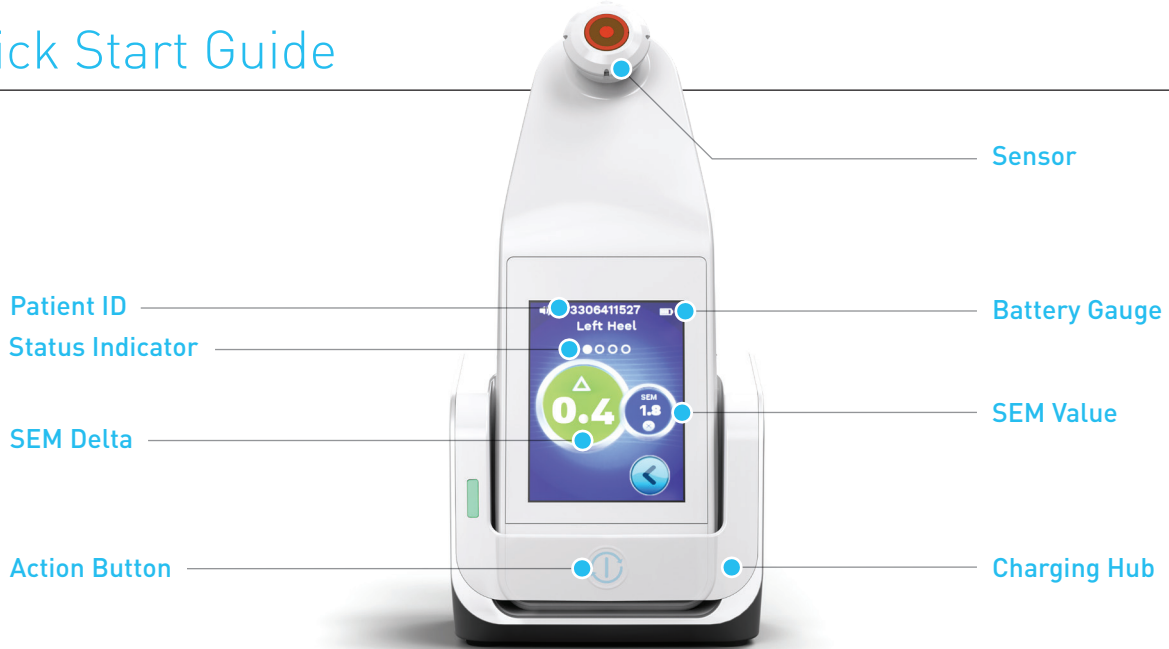
Figure 1 - Provizio™ SEM Scanner Display