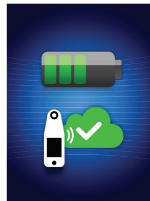
Figure 9 - Charging Screen

To charge, place the device in the Charging Hub (Figure 8). The Hub light will start flashing green. Whilst the device is in the Charging Hub, the touchscreen is disabled, the display shows the status of the data upload and battery charge level (Figure 9). The device is fully charged when five green bars are illuminated.