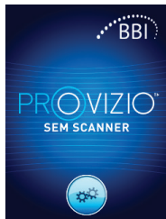
Figure 2 - Device Splash Screen

Turn on Provizio™ SEM Scanner by either removing from the Charging Hub or by pressing the Action Button until the screen illuminates and the Splash Screen displays (Figure 2). The sensor head (Figure 1) must remain untouched during this time.