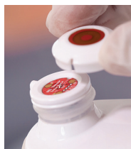
Figure 4 - Installing Provizio™ SEM Scanner Sensor

Remove the single-use Provizio™ SEM Scanner Sensor from its packaging and place on the sensor head (Figure 4). You will hear a click when the sensor is placed correctly. Note - each patient scanning session requires a new sensor.