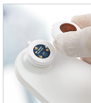
Figure 5 - Installing Provizio SEM Scanner Sensor

Remove the single-use Provizio SEM Scanner Sensor from its packaging and place on the sensor head (Figure 5). You will hear a click when the sensor has been placed correctly. Note - each patient scanning session requires a new sensor.