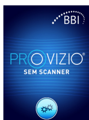
Figure 2 - Splash Screen

Turn on Provizio® SEM Scanner by either removing it from the Charging Hub or by pressing the Action Button until the screen illuminates and the Splash Screen displays (Figure 2). The sensor head (Figure 1) must remain untouched during this time.