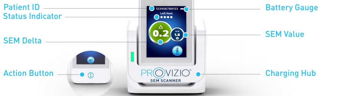
Figure 1 - Provizio® SEM Scanner & Charging Hub