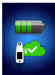
Figure 13 - Charging Screen

To charge, place the scanner in the Charging Hub (Figure 12). The Charging Hub light will start flashing green. While the device is in the Charging Hub, the touchscreen is disabled, the display shows the status of the data upload and battery charge level (Figure 13).