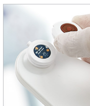
Figure 11 - Removing the Provizio SEM Scanner Sensor

If using the single-use sensor scanner, remove the sensor by gently pulling away from the sensor connector.