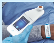
Figure 8 - Scanning a Patient Barcode

Press the Barcode Button on the Barcode Scanning Screen (Figure 7)